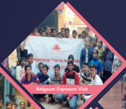
Belgaum Exposure Visit

Otis India supported the higher education of youth who are differently abled and underprivileged Children through Samarthanam Trust, SOS children's Village.