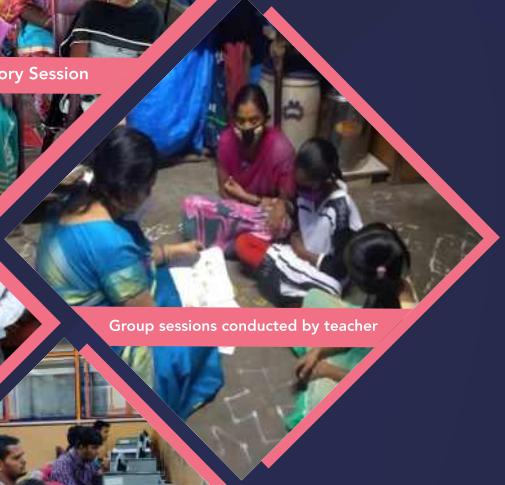
Group sessions conducted by teacher