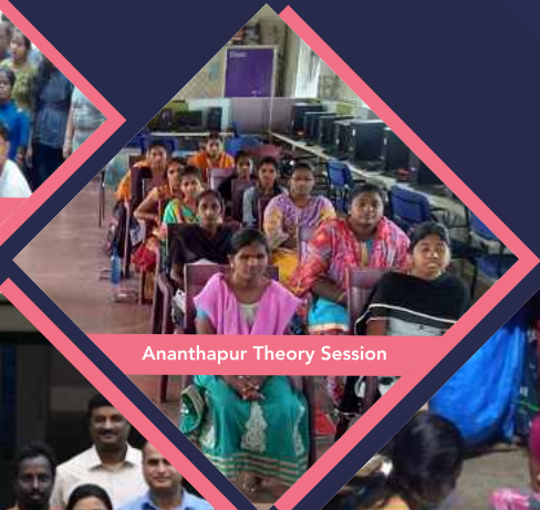
Ananthapur Theory Session