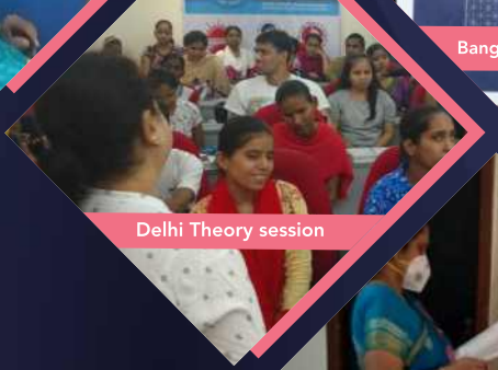
Delhi Theory session