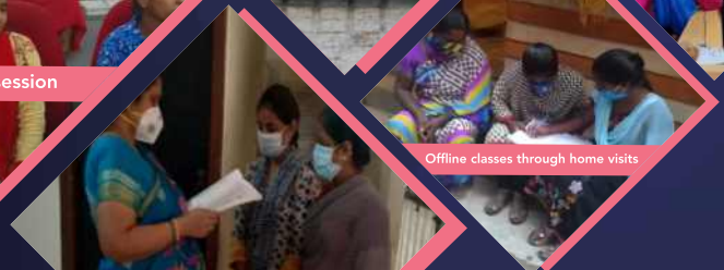
Offline classes through home visits