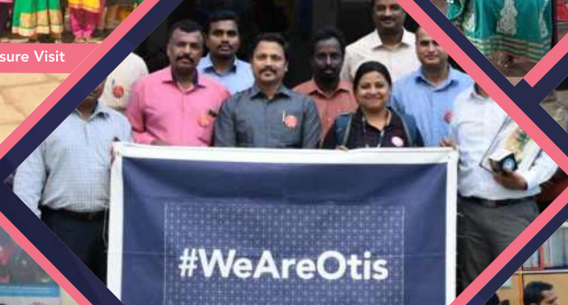
Bangalore Otis-Visit to Samarthanam