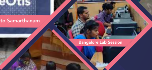
Bangalore Lab Session