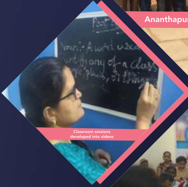
Classroom sessions developed into videos