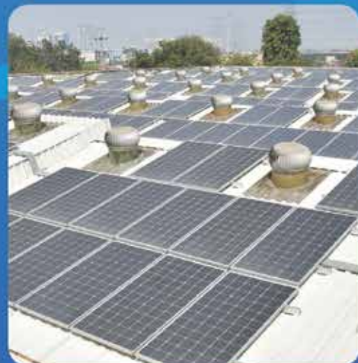
Solar Power Plant